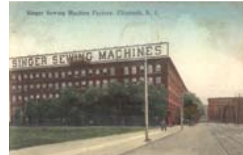
Singer Sewing Machine Factory in Elizabeth Post mark 1909